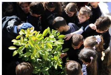
LS students planting last year

As we welcome spring after a long cold winter, RFS Project & Facilities Management team prepares to relaunch the 150 th Anniversary's Forestation Project .