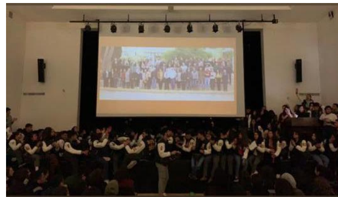
Senior chapel was hosted by Class of 2020 before IB Mock exams began.

Our own students have started their mock examinations and soon will be sitting their final exams and then graduating from school. We wish them the very best and I also wish our parents great joy as they experience what I have now experienced.*