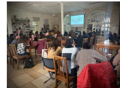
Upper School staff meeting to discuss approach to raising awareness.

It is important that we raise a generation that understands the risks of a viral pandemic but does not descend into panic.